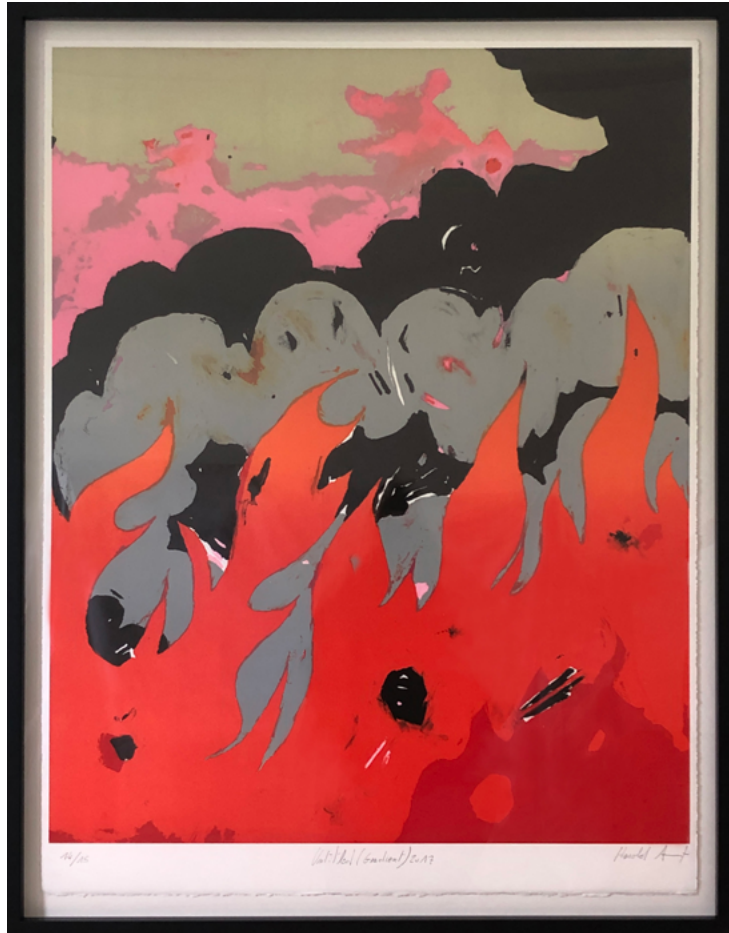
Harold Ancart (b.1980), Untitled (Gradient) , 2017