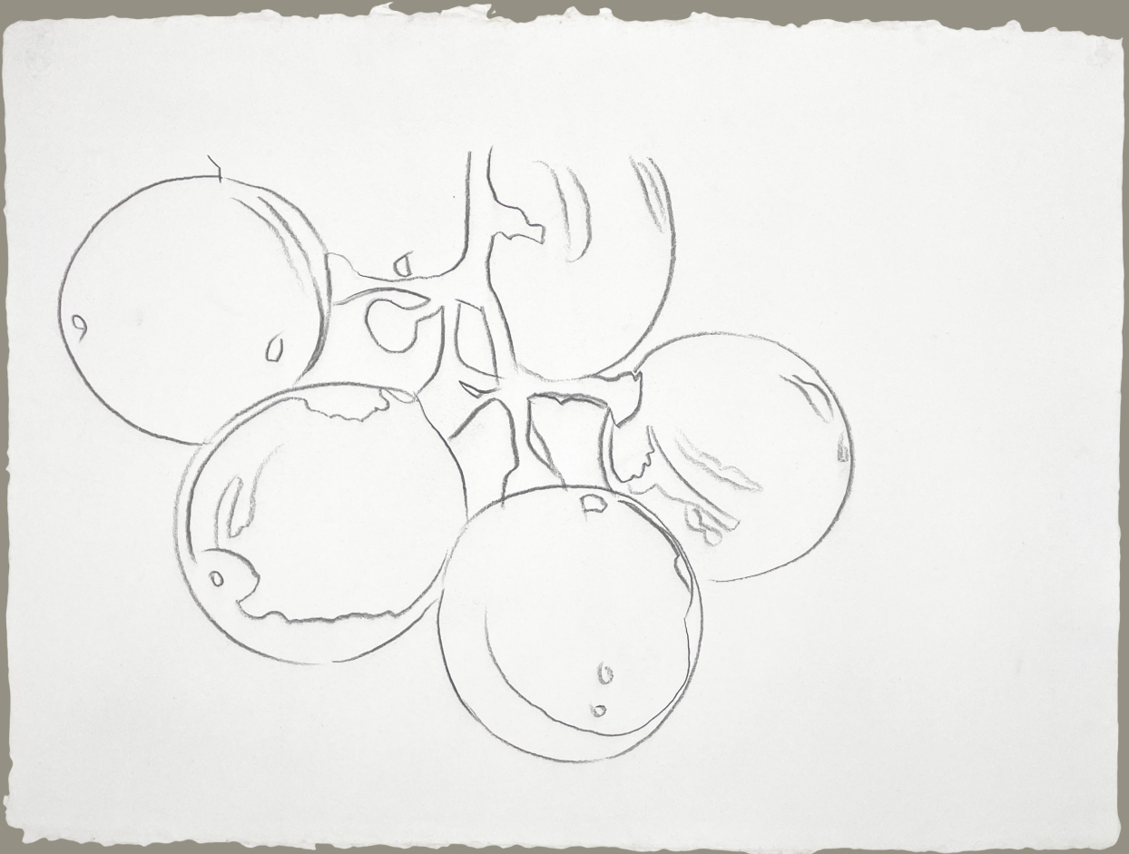
Andy Warhol, Grapes, 1979