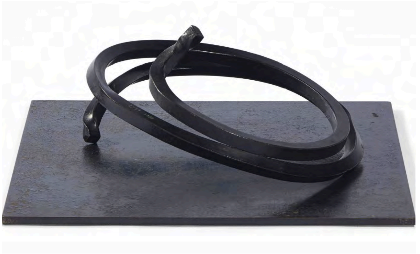
Bernar Venet, Ligne indéterminée, 1989