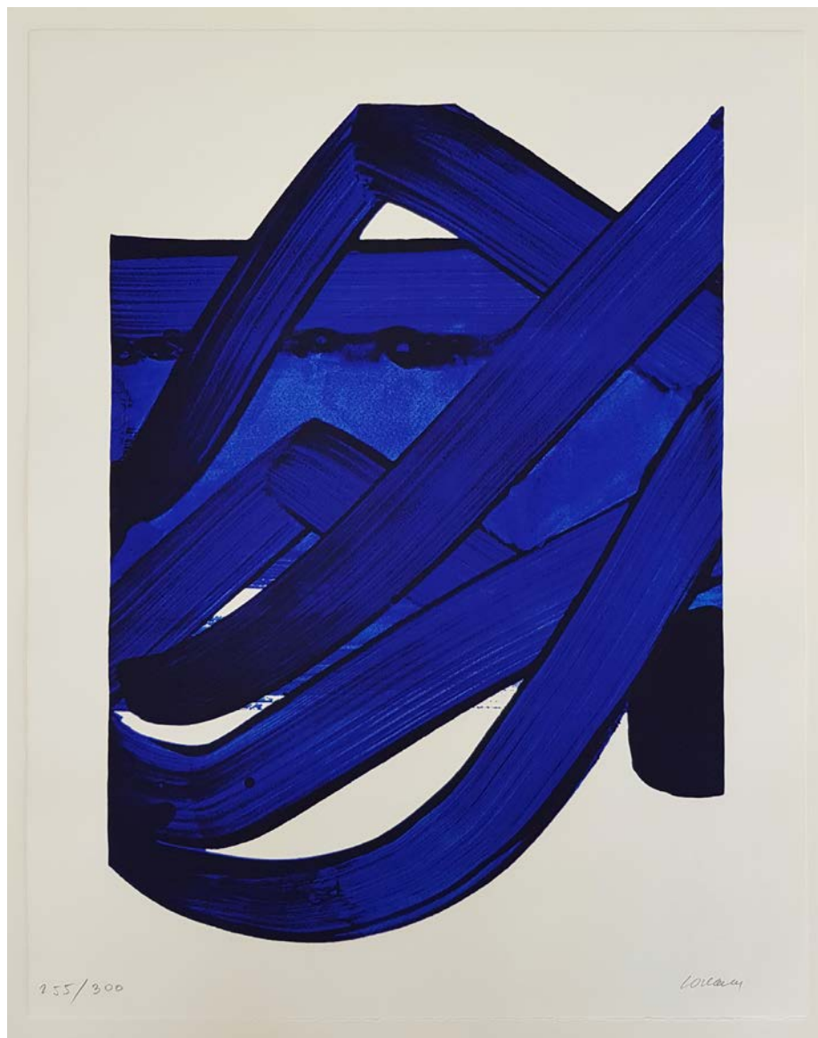
Pierre Soulages, Sérigraphie n° 18, 1988