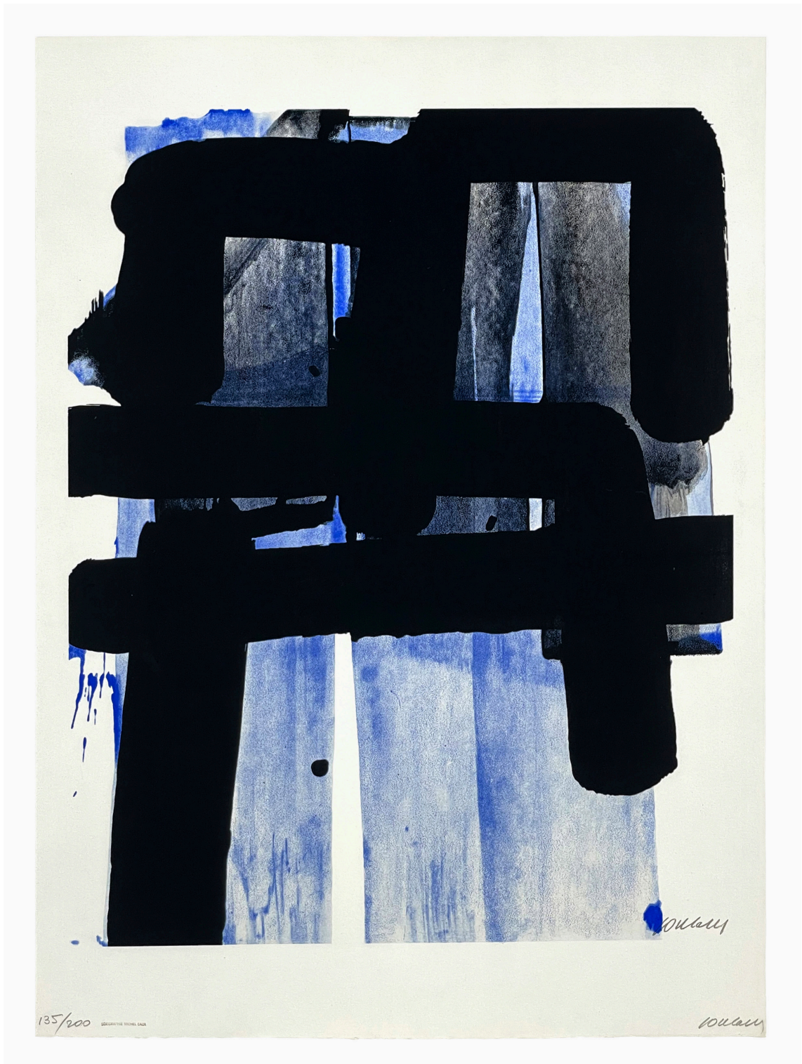
Pierre Soulages, Sérigraphie n° 2, 1973