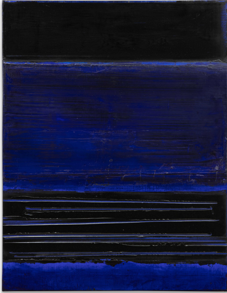
Pierre Soulages, Peinture 81 x 63,5 cm, 7 mars 2003,