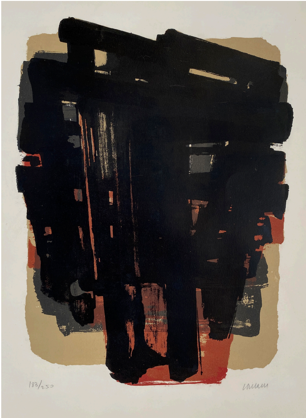
Pierre Soulages, Lithographie n° 8, 1958