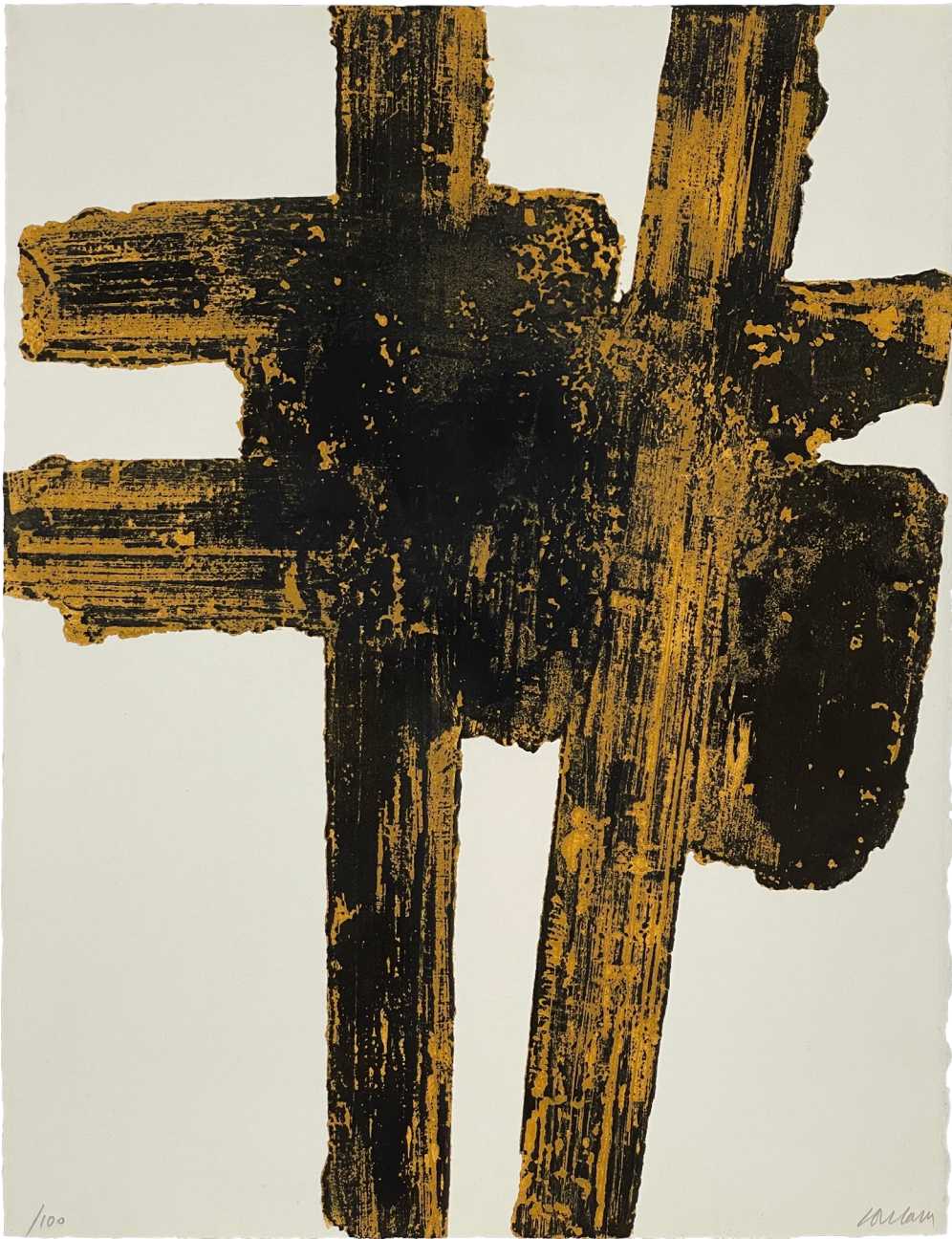
Pierre Soulages, Eau-forte XVIII, 1962