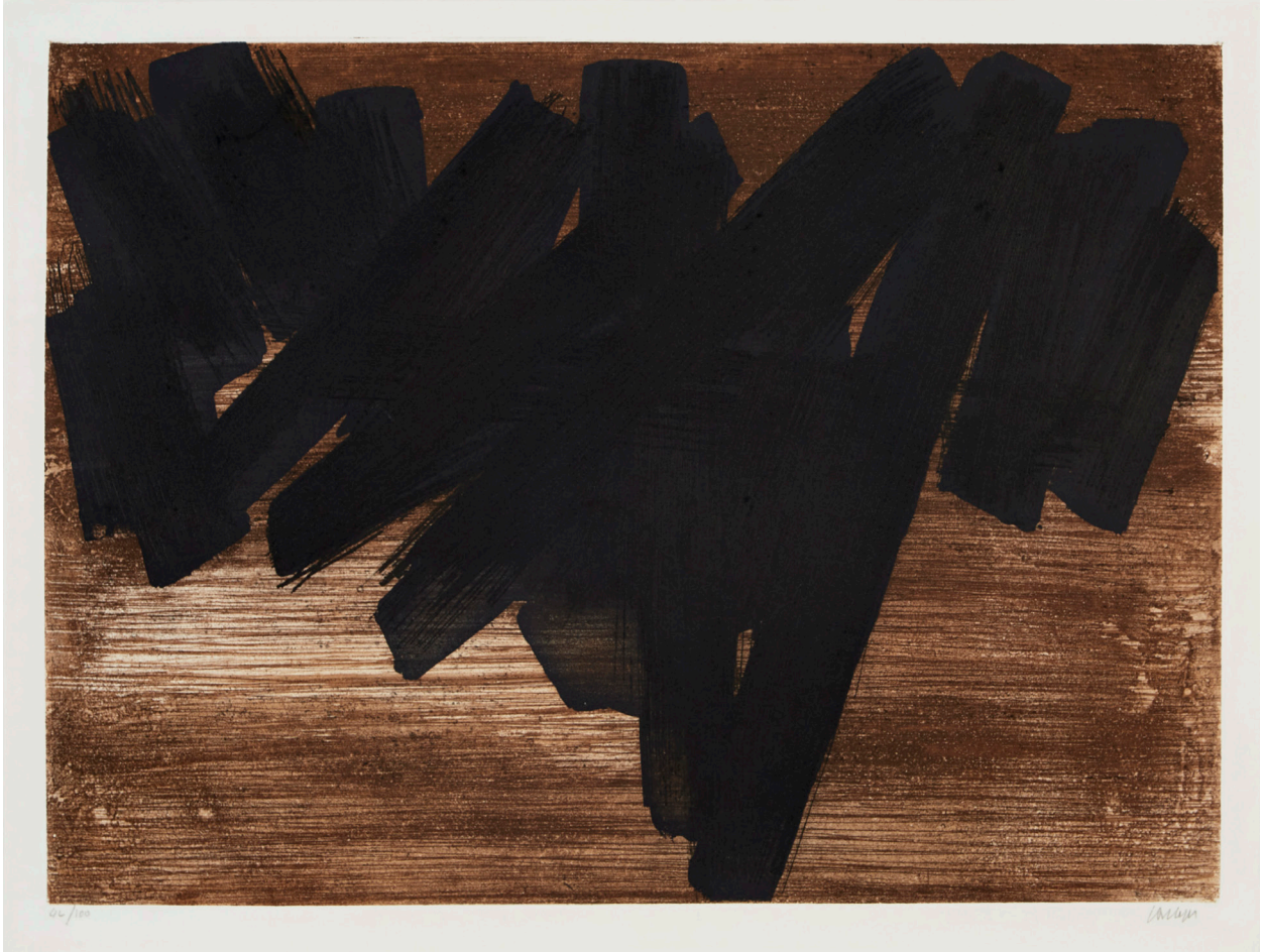
Pierre Soulages, Eau-forte V, 1957