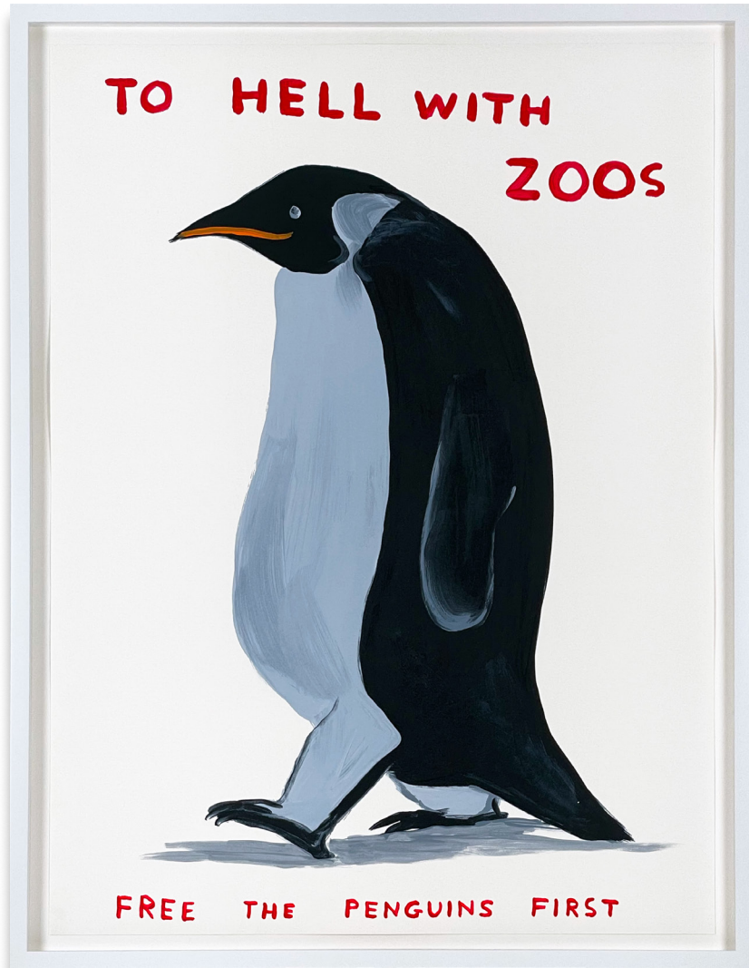
David Shrigley, To Hell With Zoos, 2021