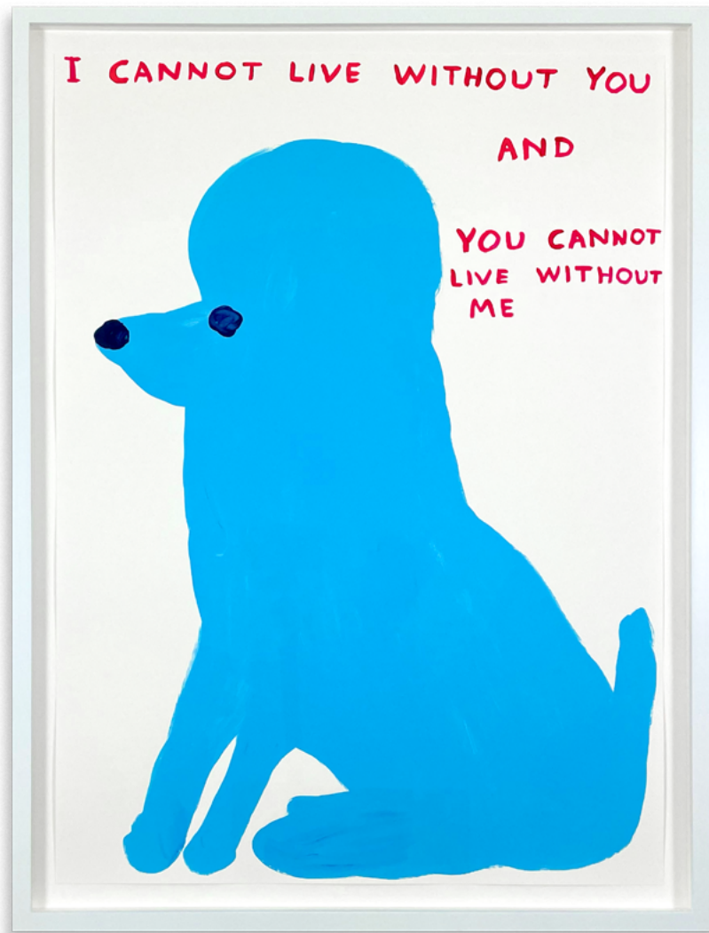
David Shrigley, I Cannot Live Without You..., 2019