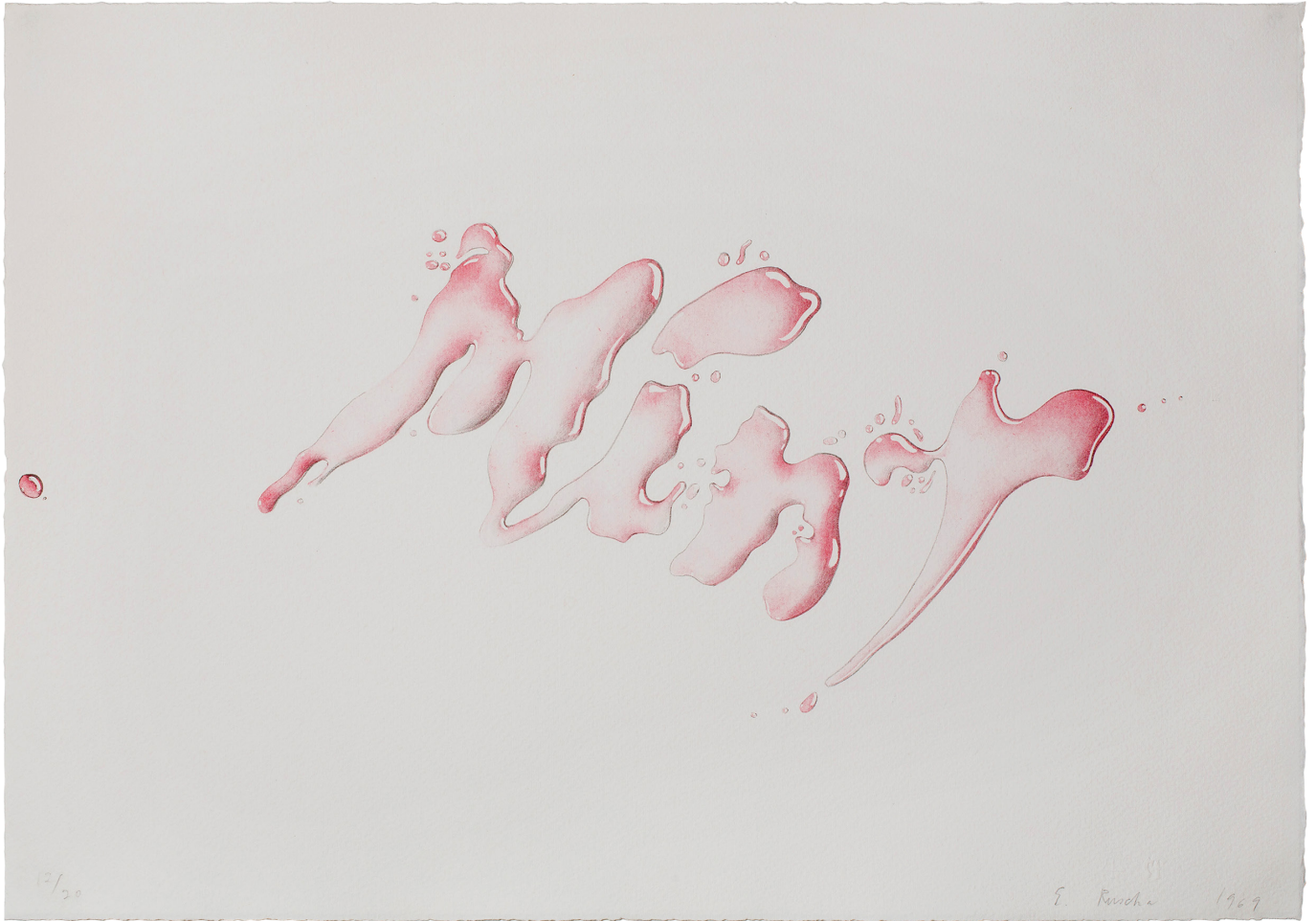
Ed Ruscha, Mint, 1969