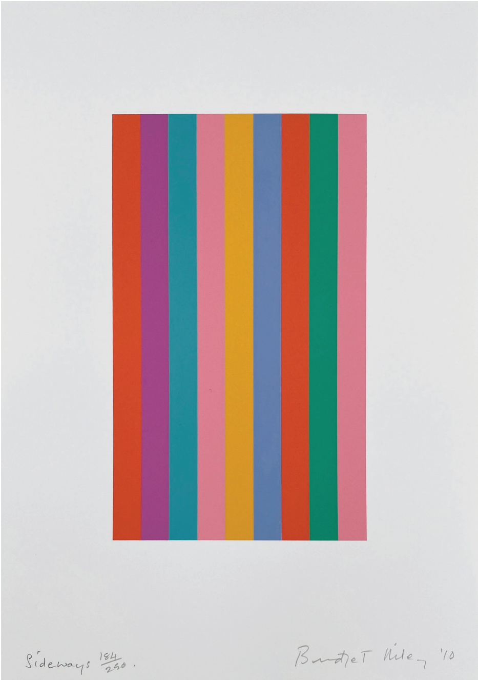
Bridget Riley, Sideways, 2010