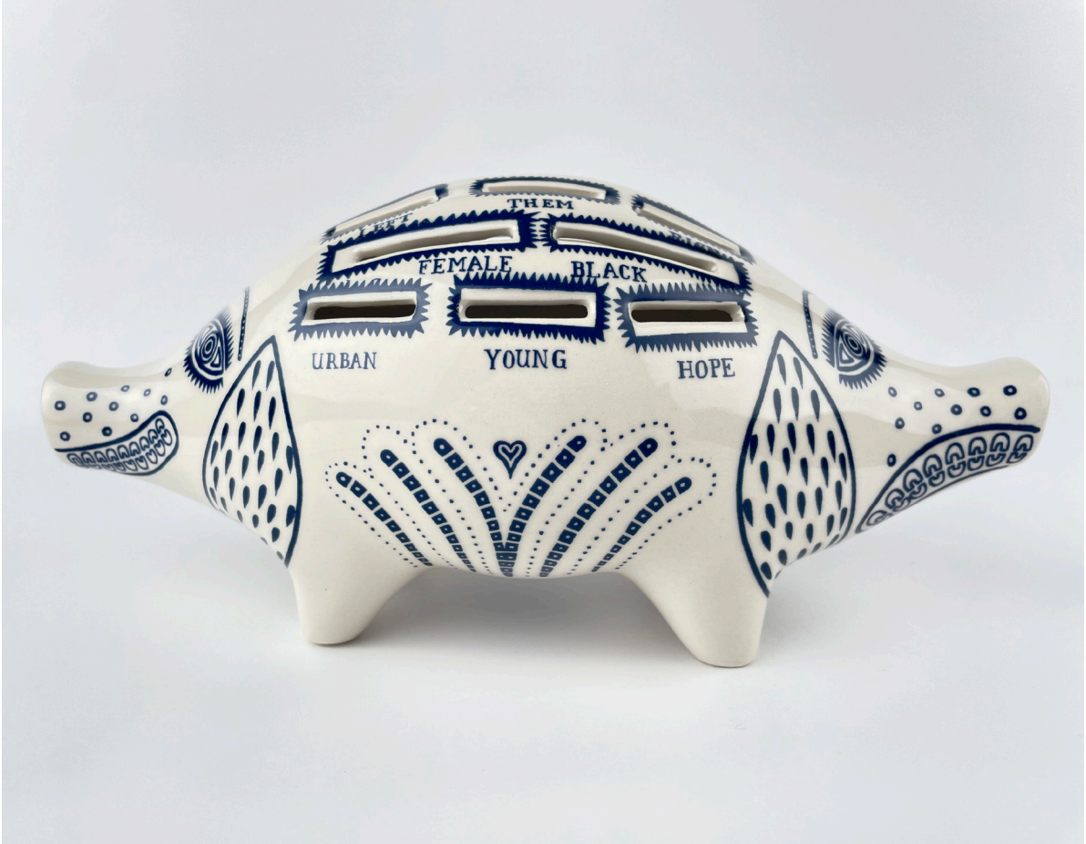
Grayson Perry, Piggy Bank, 2024