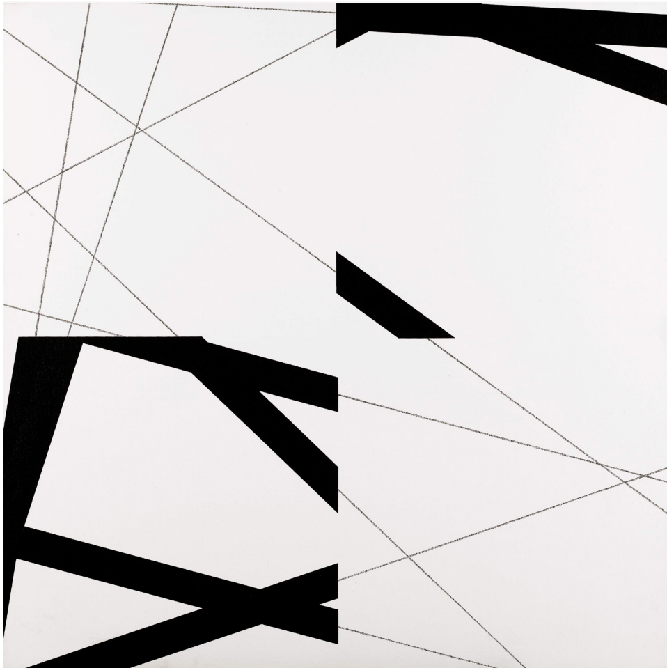
François Morellet, Strip Teasing 4 Fois , 2007