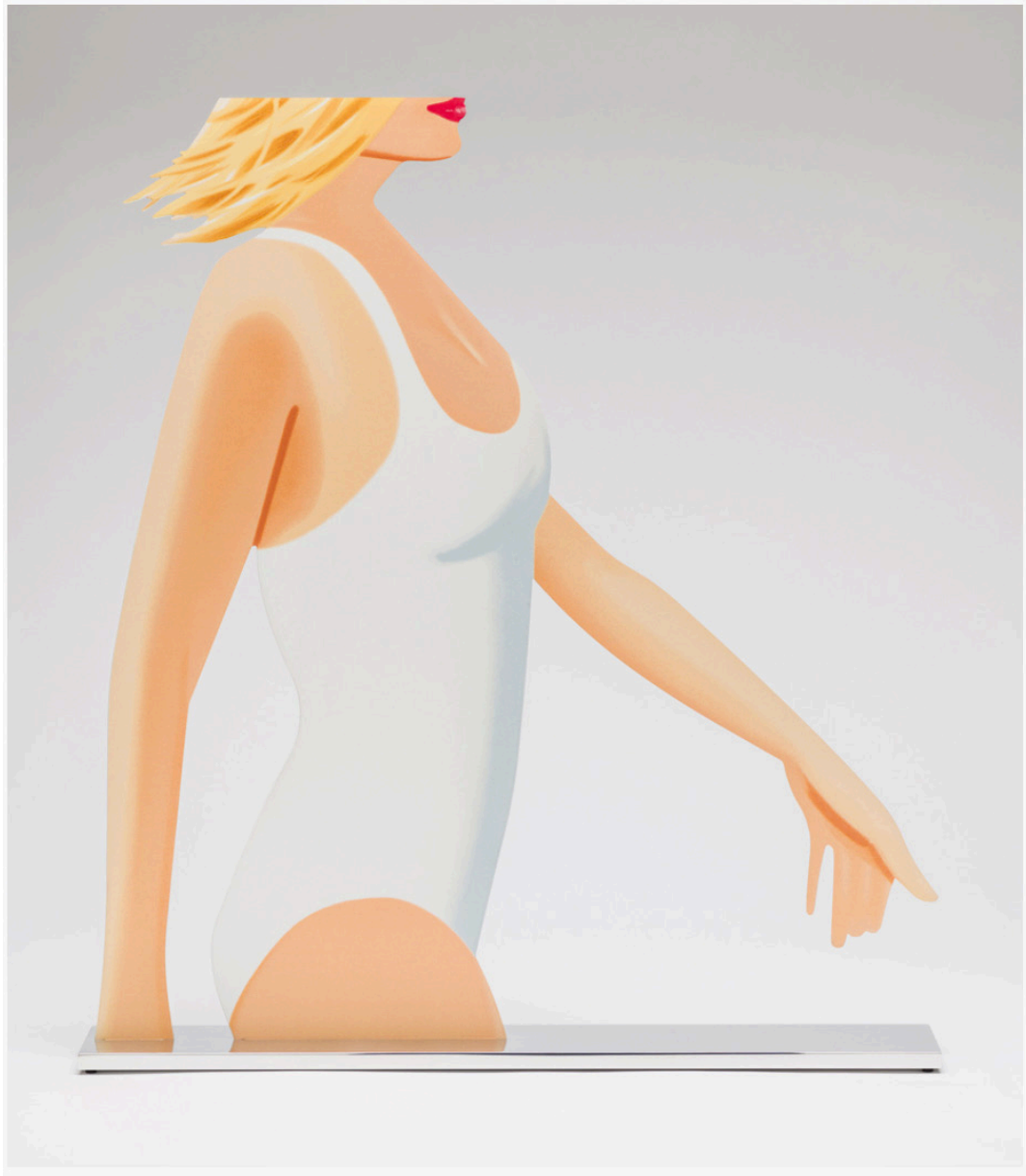
Alex Katz, Coca-Cola Girl (Cutout), 2019