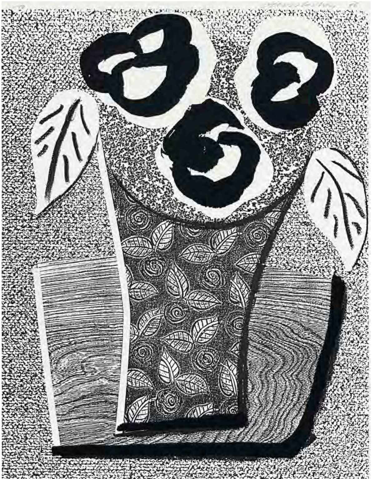
David Hockney, Three Black Flowers, May 1986