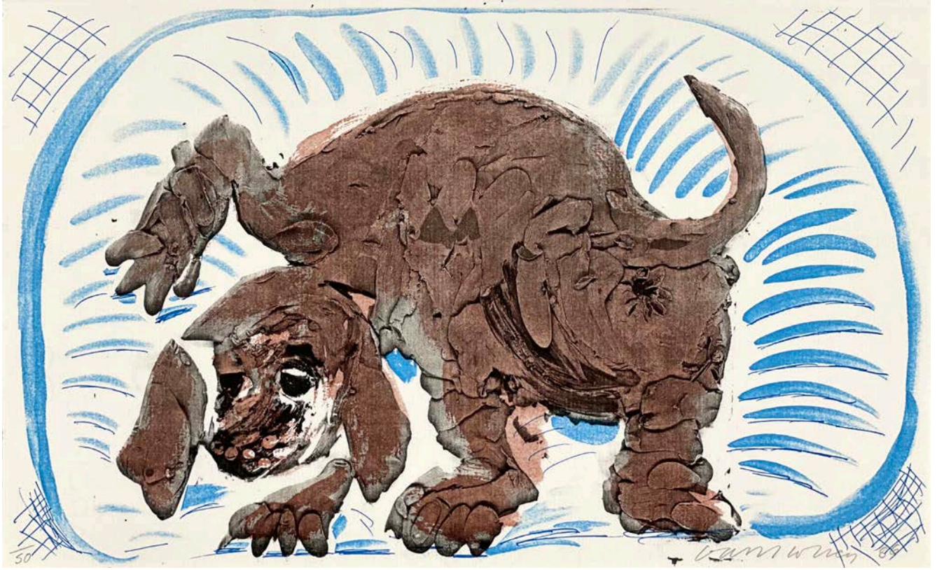
David Hockney, Stanley in a Basket, October 1986