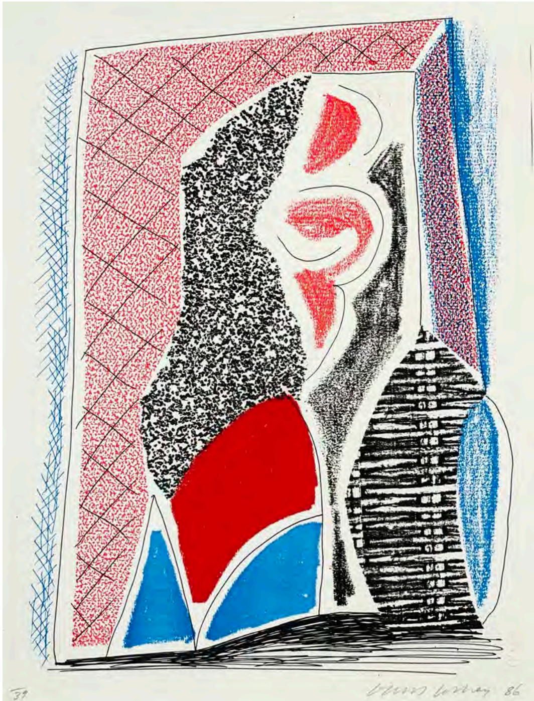
David Hockney, Red, Blue & Wicker, July 1986