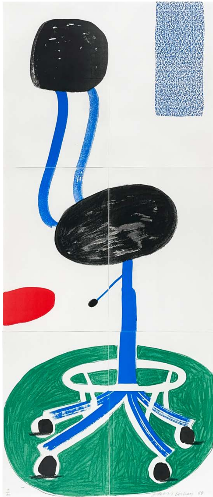
David Hockney, Office Chair, 1988