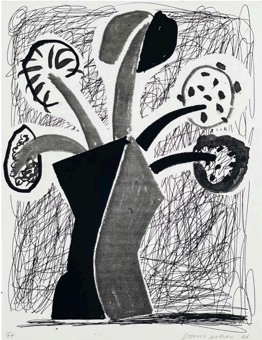
David Hockney, Growing, June 1986