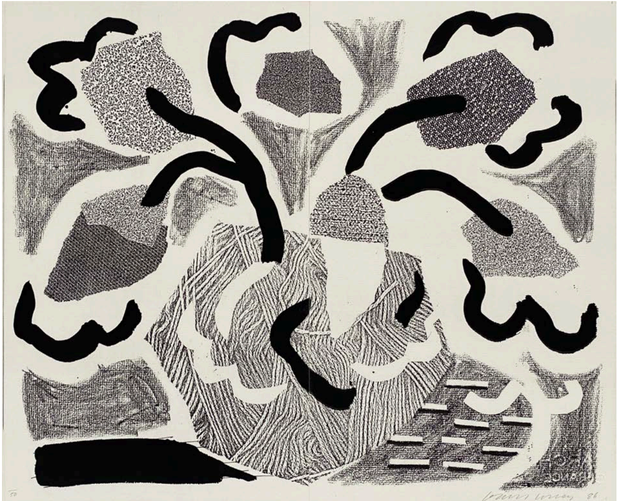
David Hockney, Grey Blooms, May 1986