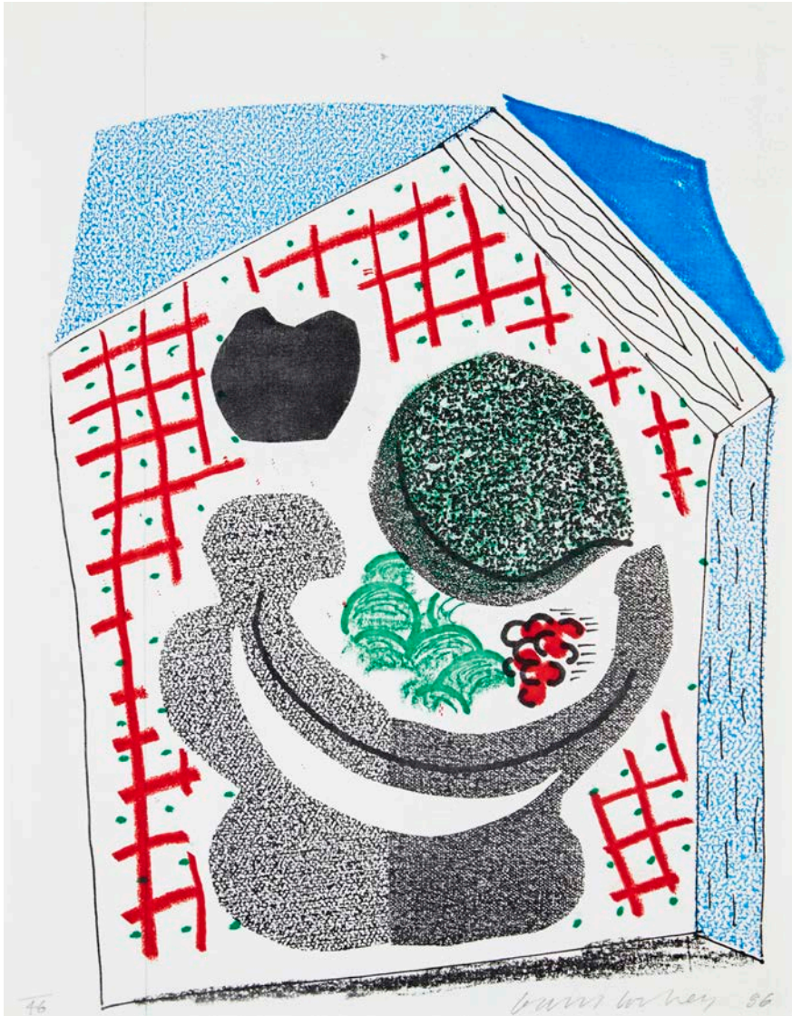
David Hockney, Bowl of Fruit, April 1986