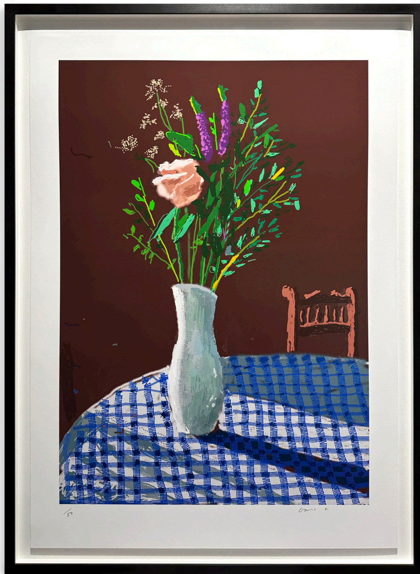
David Hockney, 4th February 2021, Flowers in a White Vase with Chair