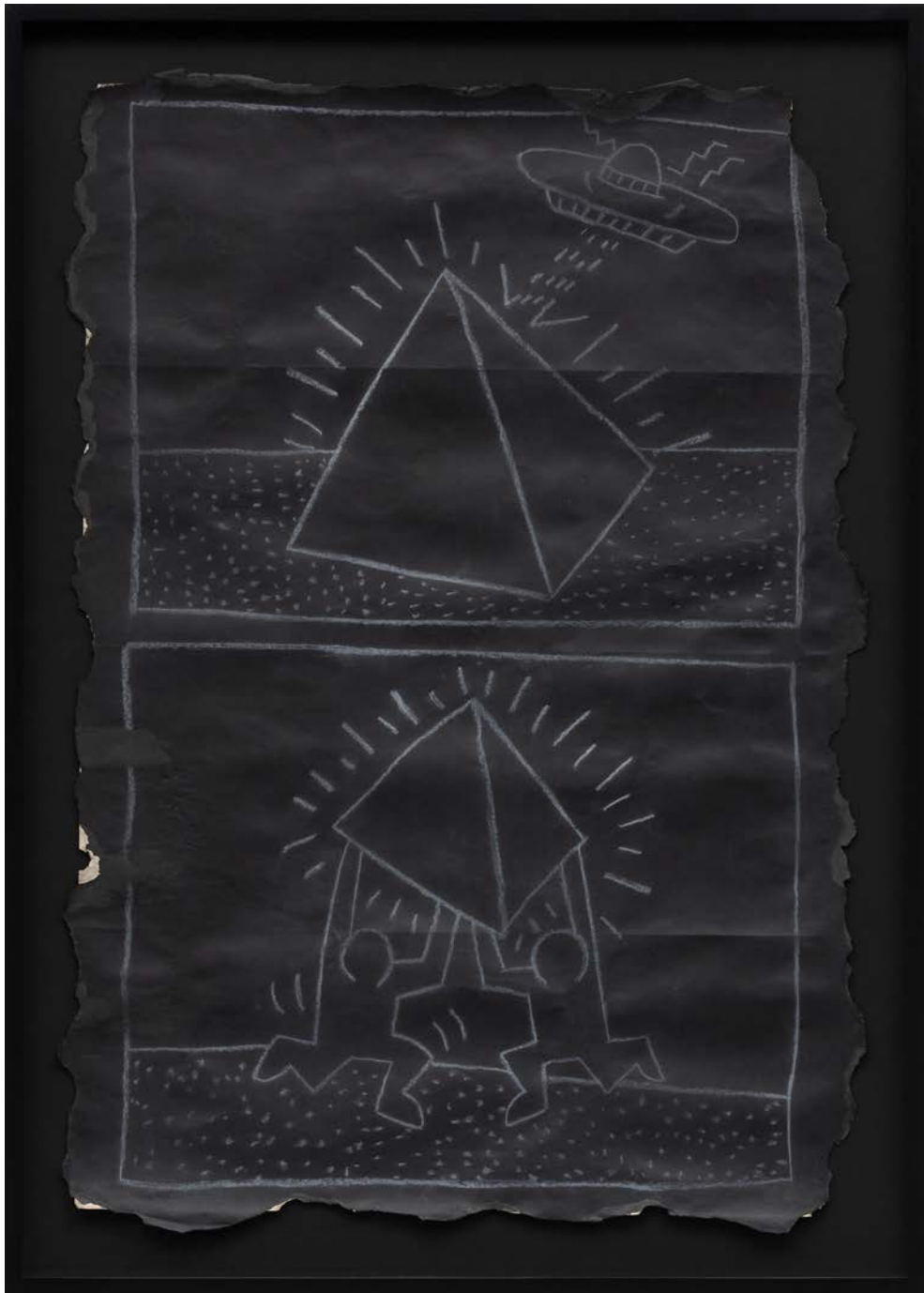
Keith Haring, Untitled, 1980-85