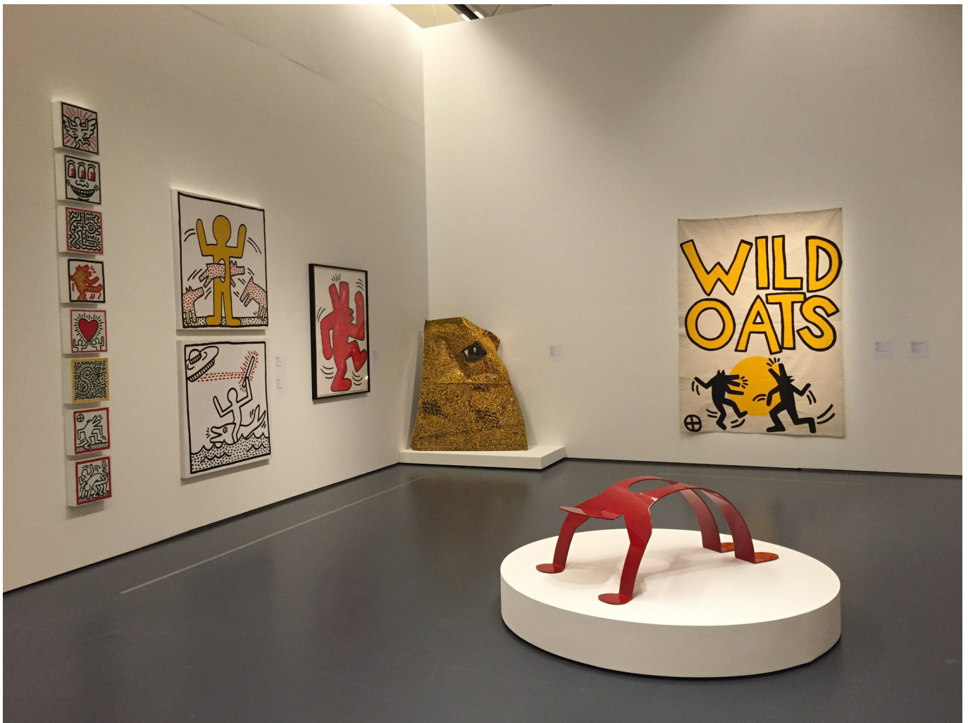
Photograph of installation at Keith Haring – The Political Line , Kunsthal Rotterdam, the Netherlands, September 19, 2015 – February 8, 2016

Untitled (Red Arching Figure) is a unique metal sculpture by Keith Haring, made for his exhibition with the great gallerist Leo Castelli in New York in 1985. It was subsequently purchased by the artist Kenny Scharf, remaining in his collection for many years. The arching figure depicts a boy breakdancing and extends the artist's practice by bringing scenes from the street indoors. It was one of the first such sculptures to be made by the artist during the period 1985-1989.