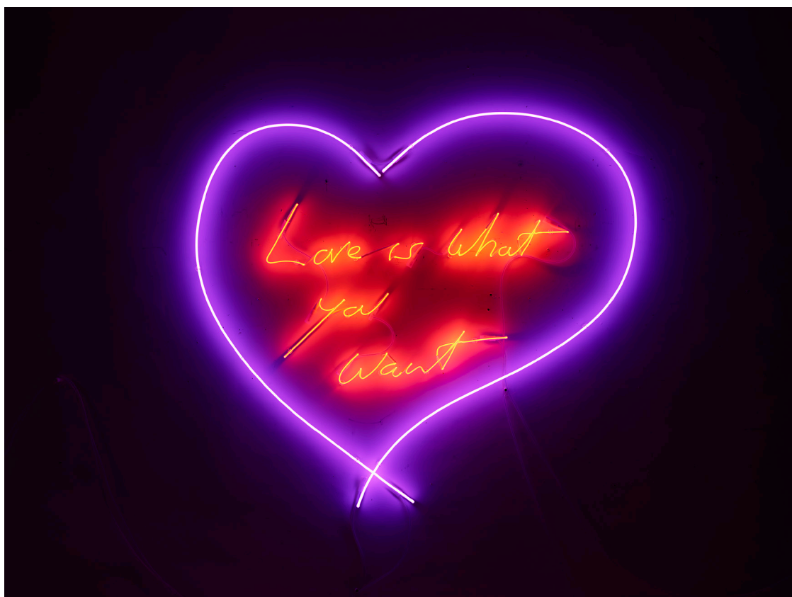
Tracey Emin, Love is What You Want, 2011