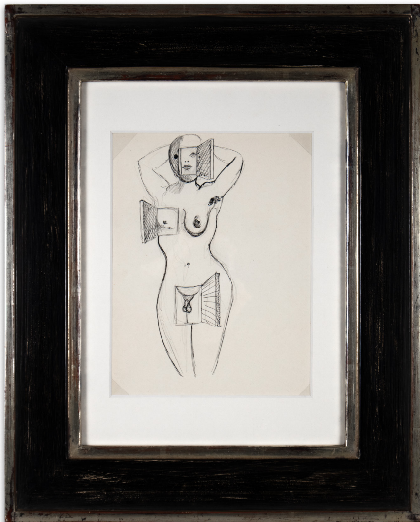
Salvador Dalí , Nu debout aux Fenêtres , 1937