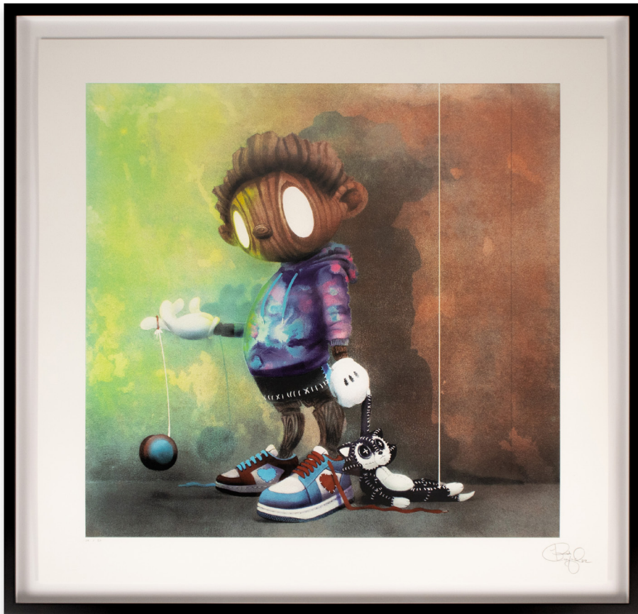
Brett Crawford, YOYO, 2022