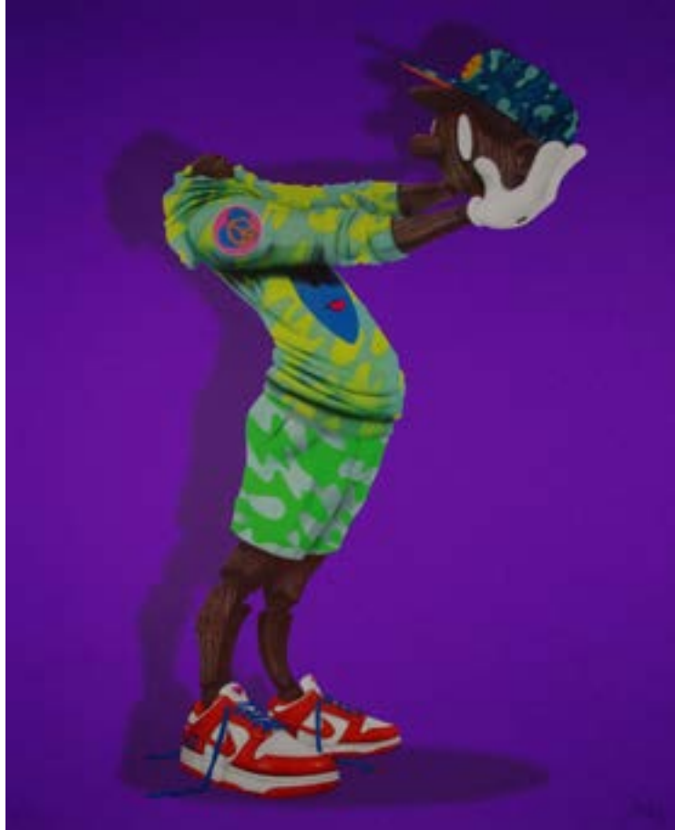
Brett Crawford, INTROSP3CT , 2021