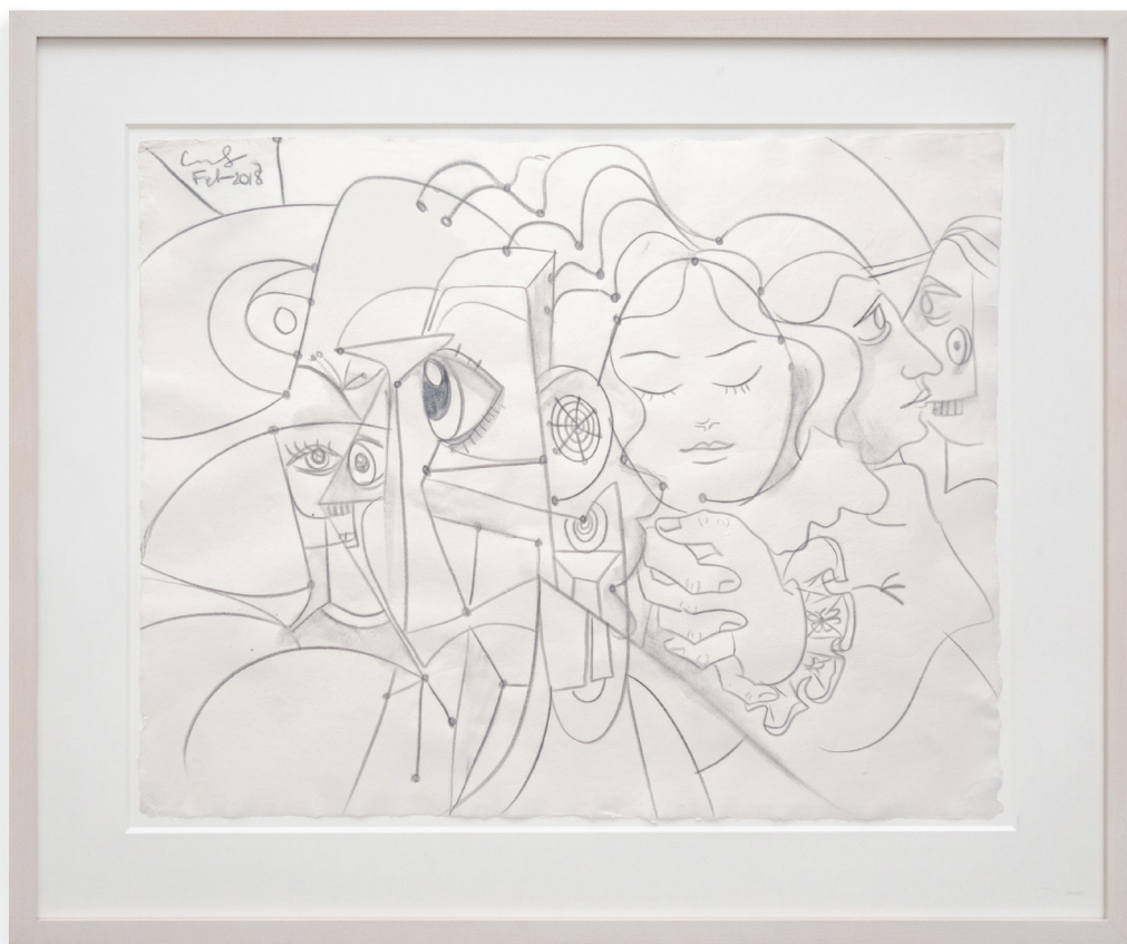
George Condo, Untitled , 2018