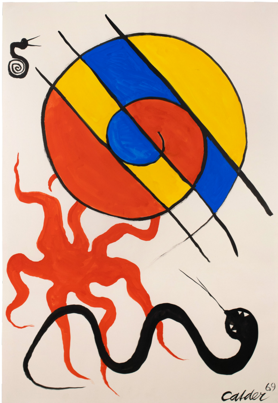
Alexander Calder, Sea Creatures , 1969