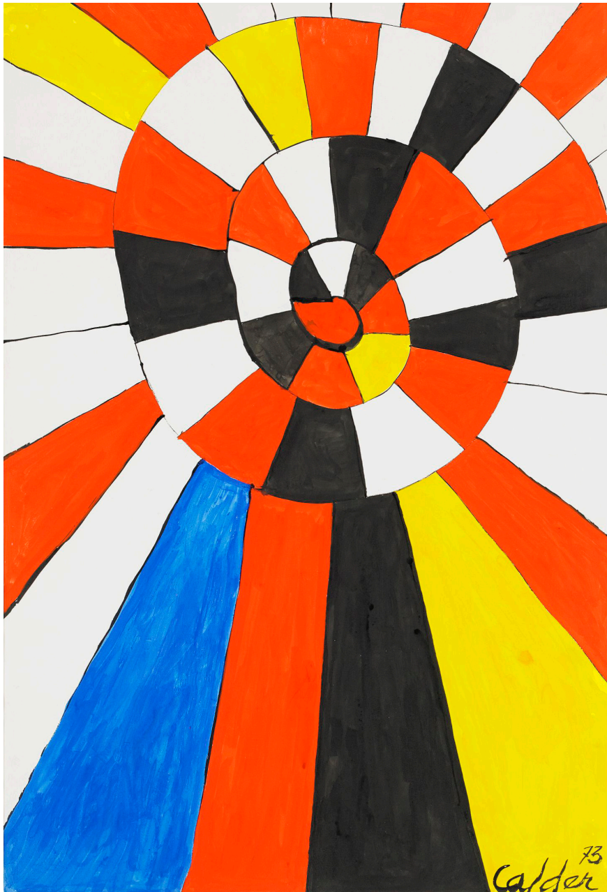
Alexander Calder, Gamble, 1973