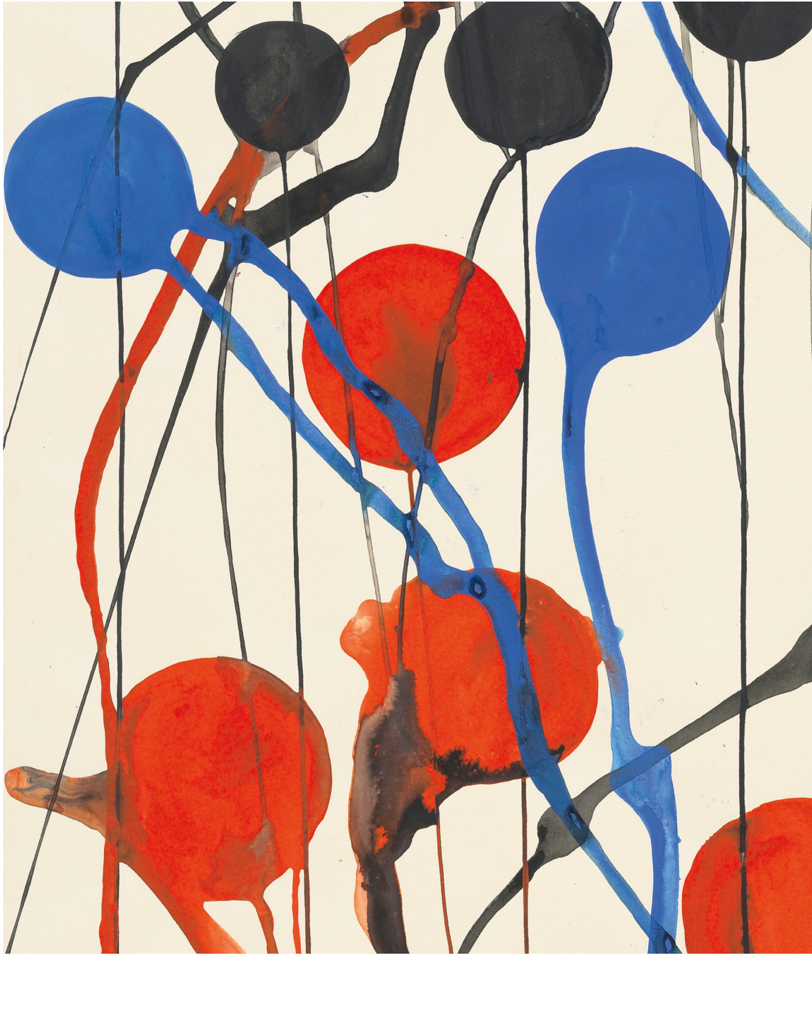
ARCHEUS / POST-MODERN