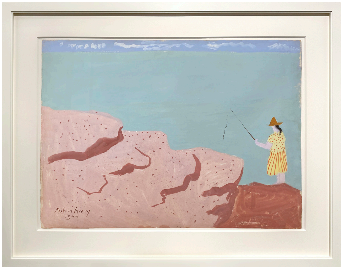
Milton Avery, Fishing By The Sea, 1944