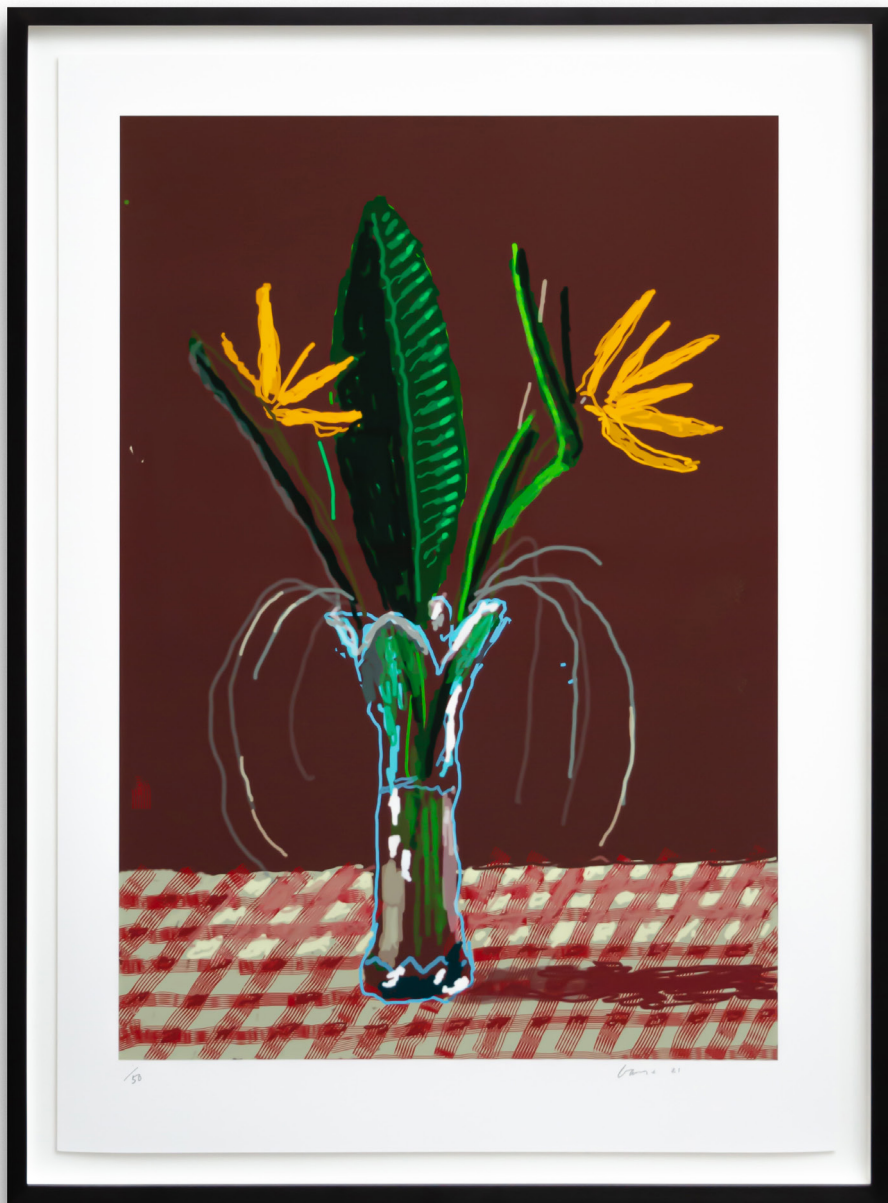
David Hockney, 26th March 2021, Exotic Flowers