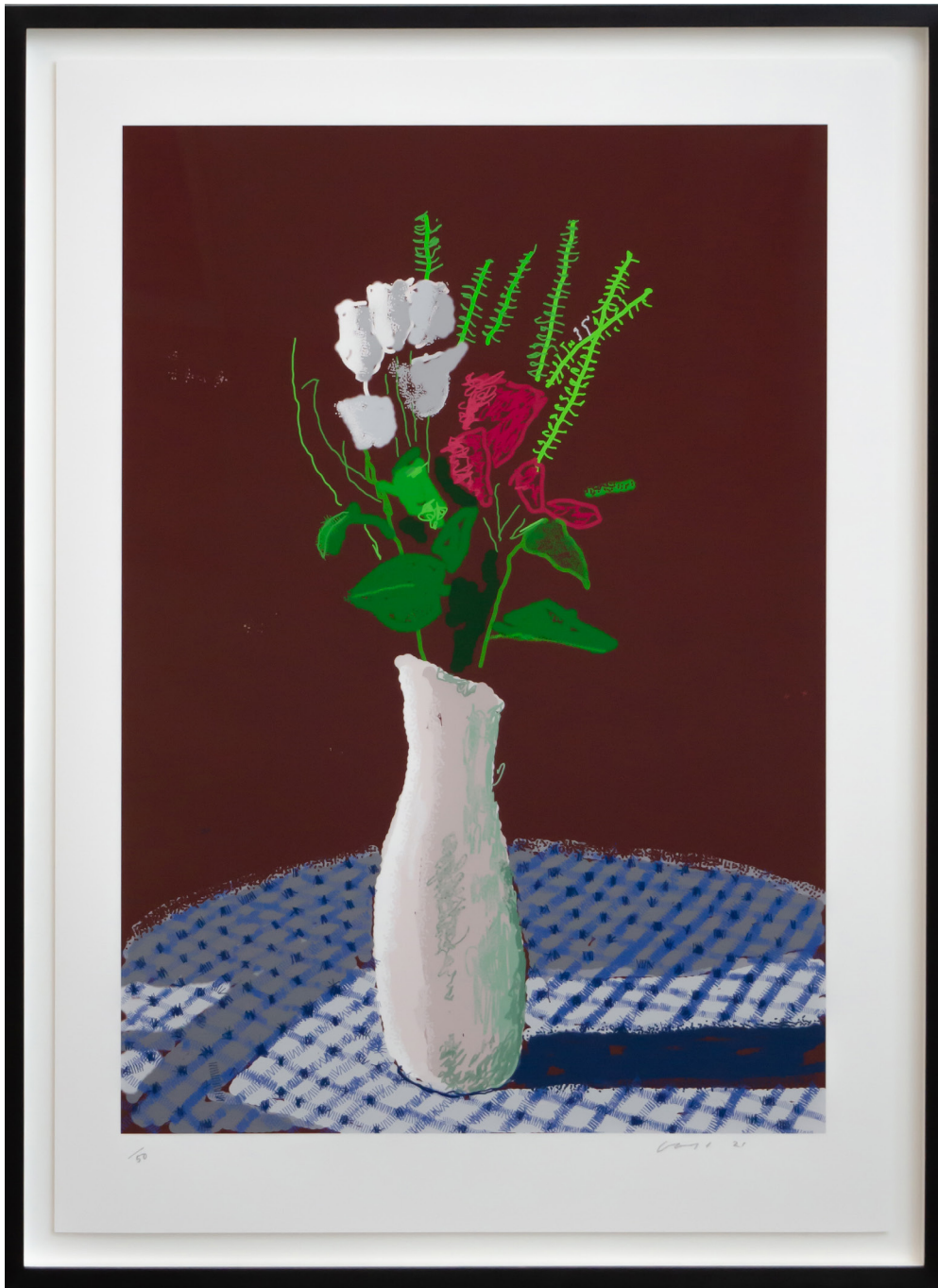
David Hockney, 30th January 2021, The First One